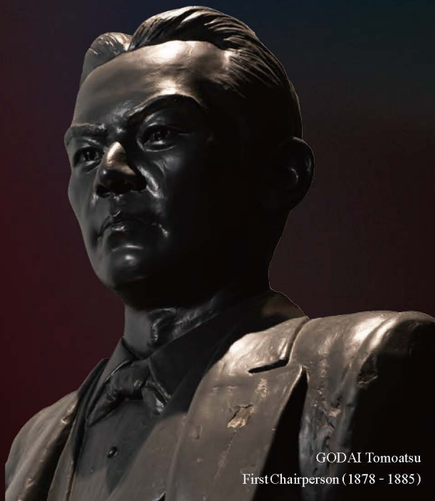
GODAI Tomoatsu First Chairperson (1878 - 1885)