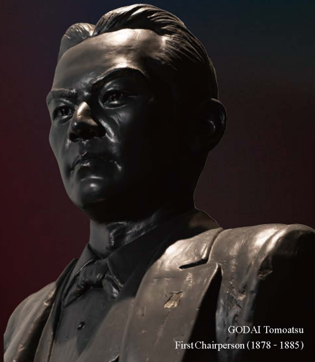
GODAI Tomoatsu First Chairperson (1878 - 1885)